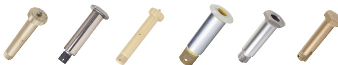
High-Strength Bolts & Fuse Pins