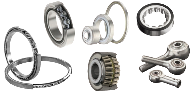
Rolling Element Bearings