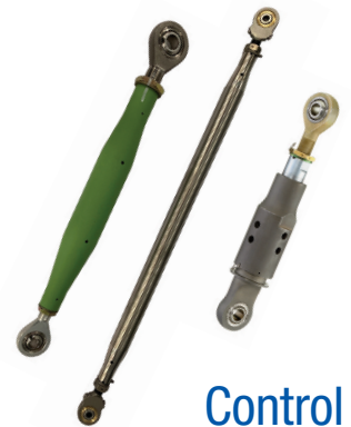
Control & Structural Rods