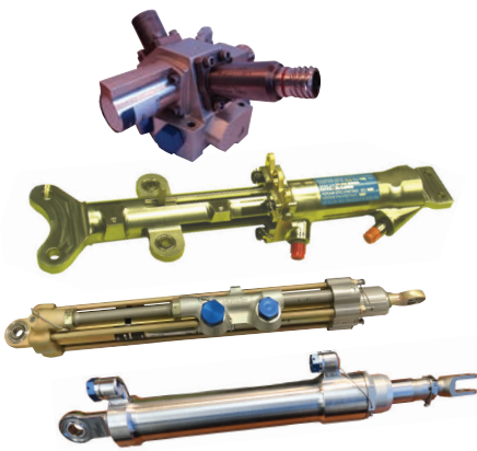
Hydraulic Actuators & Valves