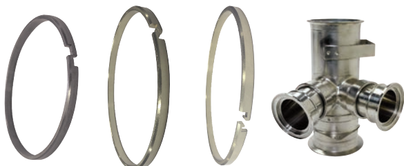
Rings, Seals, Alignment Joints